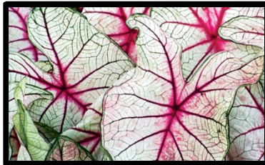
White Queen ☀️☀️☀️