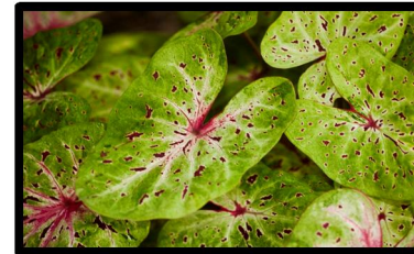
Miss Muffet ☀️☀️