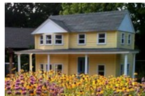
2012 Class Project at Fort Worth Botanical Garden

TCMGA—Facebook: https://www.facebook.com/ TarrantCountyMasterGardenerAssociation