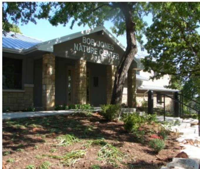
Bob Jones Nature Center

Directions to BJNC: From Hwy 114, take the White Chapel exit and go north. Continue past all of the baseball and soccer fields and turn right onto East Bob Jones Park Rd. Go a mile or so and the BJNC is on the right. For current classes, camps, and activities at the BJNC, see the website at http://www.bjnc.org .