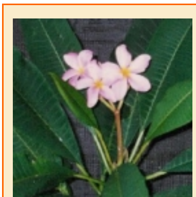
Pink Plumeria in bloom This is the cultivar propagated

To get it to bloom it has two special requirements – at least 6-8 hours of direct sun, and a very high phosphorus soil content. It likes rich, well-drained, slightly acid soil. The high phosphorus fertilizer is very important to getting the Plumeria to bloom. Its native habitat has a high lava content and is very rich in minerals, so use something like a 10-50-10 fertilizer and feed it every couple weeks during the growing season. Any good fertilizer with a large middle number (the phosphorus) will work well, and adding lava sand to the soil mix supplies other nutrients also. Too much nitrogen will cause excessive leaf and stem growth, which makes for a lanky plant with few blooms.