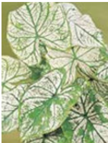
Candidum Classic White