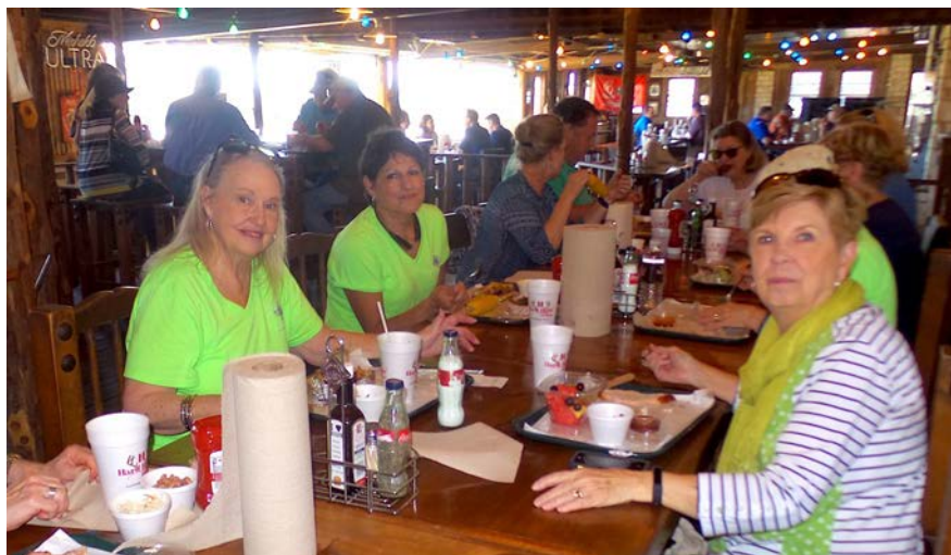
Lunching at Hard 8 BBQ