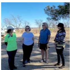
Lovely ladies enjoying the day!