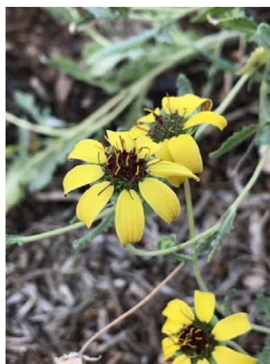
Right, Chocolate flower in Nancy Taylor's garden.