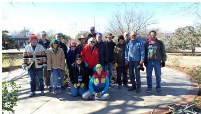
Photo below left: The UGM group at Friendship Circle Photo below right: Some of the UGM ladies taking a break

bonus is the horticultural lesson she plans each week with snacks in an A/C room after we garden.