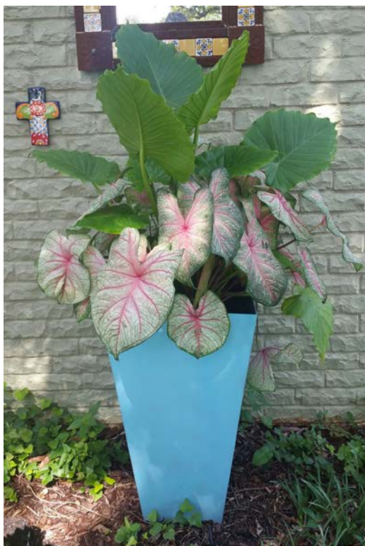
I'll go first! My current favorite container. Lorie Grandclair-Diaz

Every month I look around the Master Gardener monthly meeting and see folks all over with their phones pulled out, showing off garden pictures to their friends. Let's share them with the entire Association! Email me, (Lorie) jpeg pictures of cool things in your garden