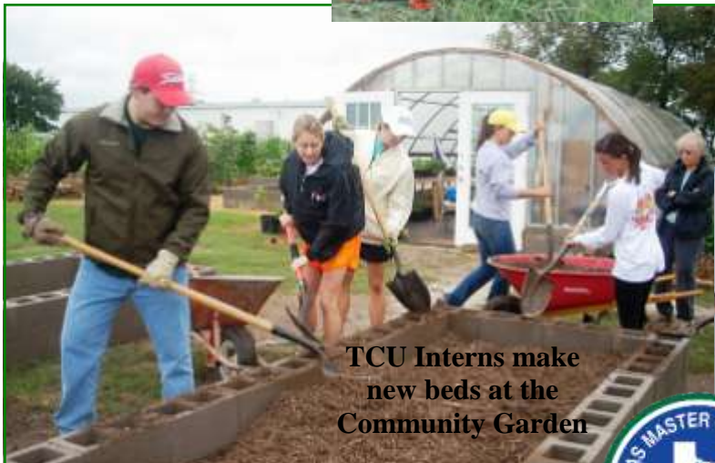
TCU Interns make new beds at the Community Garden