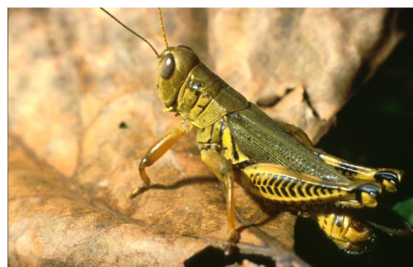
Differential grasshopper, Melanoplus differentialis , is one of the most common grasshoppers in Texas

It's been said we may be in for a bad grasshopper season this summer, so this article is intended to assist you in addressing this issue.