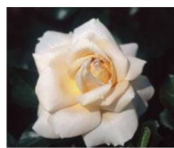
Lion's Fairy Tall - K Bloom color- Cream white/ bluish pink/ apricot Bloom type - Double Foliage - dark green, glossy Mature H x W - 3' - 4' x 2' - 3' Rose Category- Floribunda Kordes, introduced 2002. Rose of the year in England 2006