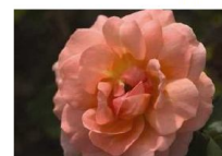
Sweet Fragrance Bloom color-Apricot Pink Blend Blooming Period-Repeat Blooms Mature H x W - 4' x 3' Rose Category-Grandiflora Spreading shrub that produces a lot of color