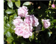
The Fairy - EK Bloom color-Light Pink Blooming Period-April-Nov Mature H x W - 2' - 4' x 4' Rose Category-Polyantha Dwarf Shrub