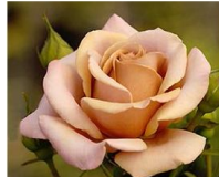
Koko Loko Bloom Color- Milk Chocolate / Lavender Bloom Type - Double Foliage - medium green Mature H x W - 3' x 3' Rose Category- Floribunda Introduced 2012