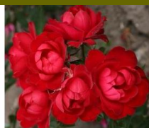
Milano Kolorscape - K Bloom Color- Bright Red Bloom Type - Single Foliage - medium green Mature H x W - 3' x 3' Rose Category- Shrub Kordes, introduced 2012