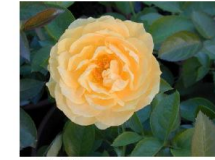
Julia Child Bloom Color-Butter Gold Blooming Period-Repeat, Blooms in clusters Spring - frost Mature H x W-4' x 4' Rose Category- Floribunda Introduced 2006. AARS award winner 2006. Hybridizer indicated the below card personally selected this rose to bear his name