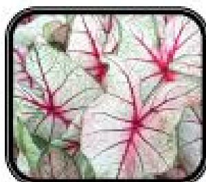
White Queen •