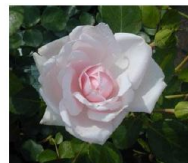
New Dawn - EK Bloom color-Blush Pink Blooming Period-Repeat Bloom Spring - Fall Mature H x W-15' -20' x 8'-20' Rose Category-Large Flowered Climber Awarded first place plant Voted World's favorite 1997