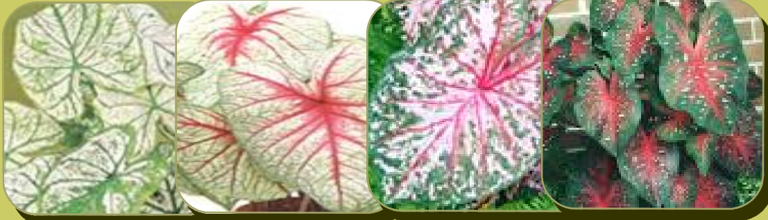
Candidum Classic White