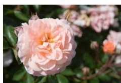
Drift- Apricot Bloom Color- Apricot Bloom Type - Semi-Double Foliage - dark green, glossy Mature H x W 1½' x 2 1/2' Rose Category- Shrub Very resistant to disease Introduced 2010 Ground cover / Spreading