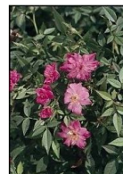
Salmon Vigorosa - K Bloom color- Salmon Pink Blooming Type - Double Mature H x W - 2' - 3' x 3' - 4' Rose Category-Shrub Kordes, introduced - 1999