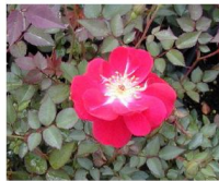
Martha Gonzalez Bloom color - Bright Red Blooming Period-Repeat, Blooms spring - frost Mature H x W - 2' - 3' x 2' - 3' Rose Category- China Introduced 1984. Ideal for hedges and borders. Remove blooms, stems and heads to promote more blooms. This rose is "self-pruning", can prune it with electric hedge clippers. Very resistant to disease