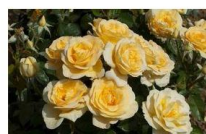
Sunshine Daydream Bloom color- Light Yellow Blooming Type - Double, repeat bloomer Mature H x W - 3' - 4' x 4' - 5' Foliage - Dark green, glossy Introduced - 2011. Upright, bushy