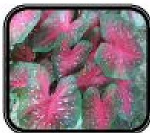
Red Flash •