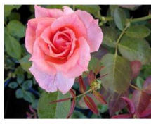
Freckles Bloom Color- Pink Yellow Blend Bloom Type-Double, repeats later in season Blooming Period-Compact, clusters almost central bloom Mature H x W - 3' - 4' x 4' - 5' Rose Category- Shrub Buck Rose, introduced in 1976