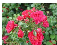
Raspberry Vigorosa - K Bloom color- Dark Pink Blooming Type - Semi-Double Foliage - medium green Mature H x W - 2'-2" x 2 1/2' Rose Category-Shrub Kordes, introduced - 2003