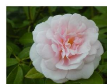
Spice - EK Bloom color- Pink Blush Blooming Period- Blooms from spring - frost in clusters. Foliage - Medium green, semi glossy Mature H x W - 3' - 5' x 3' x 4' Rose Category- China Upright, bushy