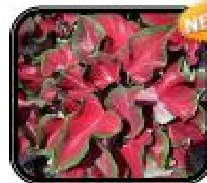
Red Ruffles •

Strap leaf caladiums are considered more heat and sun tolerant than fancy leaf caladiums. They have smaller, narrower, and more elongated leaves on short petioles giving the plants a more compact habit. This type of caladium produces more leaves per tuber. Height is 12" to 14". Choose between Red Ruffles and Miss Muffet .