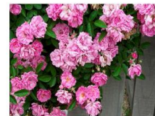
Peggy Martin Bloom color-Pink Blooming Period-Repeat Bloomer Spring-Frost Mature H x W - 6' - 10' x 12' - 15' Rose Category-Climber Rose survived Hurricane Katrina Percentage of proceeds goes to New Orleans horticulture restoration