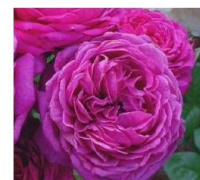
Purple Rain - K Bloom color-Mauve Blooming Type - Double Mature H x W - 2' x 3' Rose Category-Shrub Kordes, introduced - 2009