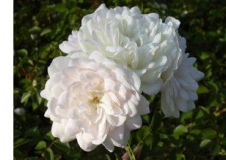
Sea Foam - EK Bloom color-Creamy White Blooming Period-Repeat Bloom Spring-Frost Mature H x W - 2' - 6' x 4' - 8' Rose Category-Shrub Short growing ramble. Can be a climber or ground cover.