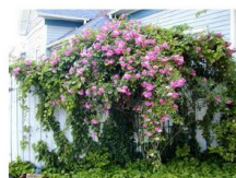
Climbing Pinkie - EK Bloom Color-Rose Pink Bloom Type-Semi-Double Blooming Period-Spring-Fall Mature H x W-12' x 6' Rose Category- Cl. Polyantha Climber