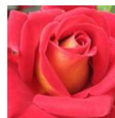
Smart & Sassy Bloom color- Satin Red w/ Golden Reverse Blooming Type - Fully Double Mature H x W - 2' x 2' Foliage - Highly polished, deep lush green Rose Category-Miniature Biltmore, introduced - 2012 Upright, smaller shrub