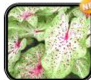
Miss Muffet •