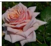
Lady Ash Bloom Color- Apricot Salmon Bloom Type-Double Foliage - glossy green Mature H - 10'-12' Rose Category- Large flowered climber Biltmore, introduced 2012