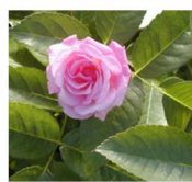
Mme. Antoine Muri - EK Bloom color-Pink Blend Bloom Type-Repeat Foliage - light green, semi glossy Mature H x W - 3' - 5' x 3' - 4' Rose Category- Tea Year discovered - 1901