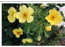
Lemon Fizz - K Bloom Color-Bright Yellow Bloom Type - Double Foliage - medium - dark green Mature H x W - 3' x 3' Rose Category- Shrub Kordes - introduced 2012