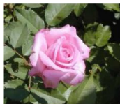
Bibiana's Dream - EK Bloom Color- Pink Blooming Period-April-Nov. Mature H x W 3'-6" x 3'-4" Rose Category- Shrub

Planting Guide: Prepare planting bed with expanded shale, add 3" mulch after planting; water twice a week.