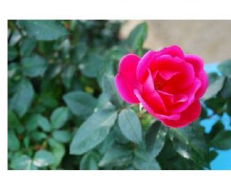
Flamingo Kolorscape - K Bloom Color- Deep Pink Bloom Type - Single Foliage - medium green Mature H x W - 3' x 3' Rose Category- Shrub Kordes, introduced 2012