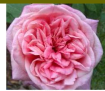
Mouder Tiller - EK Bloom Color- Apricot Pink Bloom Type - Repeat, reliable blooms from spring - frost. Very double, large, ruffled petals. Foliage - medium green Mature H x W - 3' - 6' x 3' - 4' Rose Category- Tea