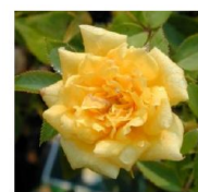
Rise n Shine- Miniature Bloom color-Medium Yellow Bloom - Double Mature H x W - 18"-24" x 18" - 24" Rose Category-Miniature Fragrance-Slight Upright growth