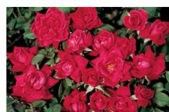
Knock-Out Double Red Bloom Color- Medium Red Bloom Type-Double blooms in clusters Foliage- deep purplish, green Blooming Period-Spring-Fall Mature H x W - 3' - 4' x 3' - 4' Rose Category- Shrub