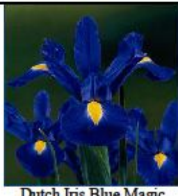
Dutch Iris Blue Magic 18"-22" inches tall Dutch Iris were hybridized in the early 1900's from a 16th century native Spanish variety. Deep heliotrope-blue with yellow blotches. Linear form Blooms late Spring Zones 5-8