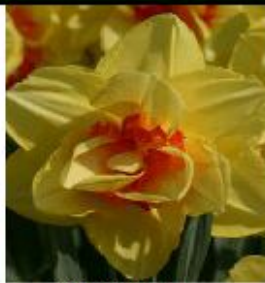
Narcissi Tahiti (Double) 14"-16" inches tall Very showy award winning with soft yellow perianth and double cup with orange center. 14"-16" Zones 3-8