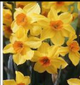
Narcissi Falconet (Tazetta) 12"-14" inches tall Bold beauty has yellow perianth with orange cup. 4-8 florets per stem. Fragrant. Ideal for Southern gardens. Zones 5-9