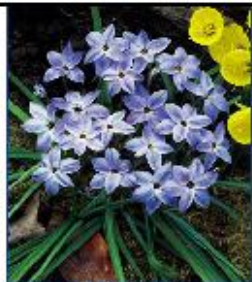
Ipheion uniflorum Wisley Blue Star Flower 3"-6" inches tall Circa 1836 sweetly scented Naturalizing star-shaped flowers are deep blue. Plant 4" apart 4" deep Blooms early to late Spring Zones 5-9