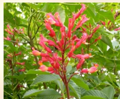
Aesculus pavia Red Buckeye

Where: Randol Mill Park Greenhouse 1901 W Randol Mill Rd. Arlington, TX (The greenhouse is in the rear of the park behind the swimming pool.)