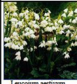
Leucojum aestivum Summer Snow Flake 12"-15" inches tall English native circa 1759 Bell shaped white flower with green tips. Strappy grass-like foliage. Hardy naturalizer. Zones 4-9