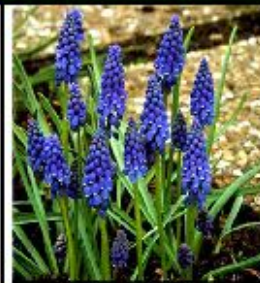
Muscari armeniacum Grape Hyacinth 4"-6" inches tall Circa 1878 Native to Turkey Naturalizes. This original Blue Grape Hyacinth is bright cobalt blue. Normally deer proof. Zones 5-8