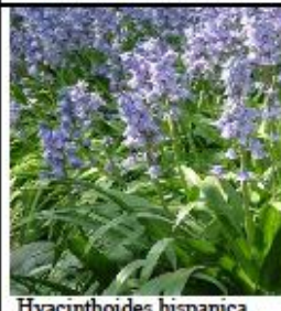
Hyacinthoides hispanica Excelsior Spanish Bluebells 12"-15" tall Very adaptable. Circa 1601. Produces 15-20 bell shaped flowers on long stems with strap-like foliage. This 1906 award winner is blue violet with darker marine-blue mid veins. Shade tolerant. Naturalizes. Zones 4-10