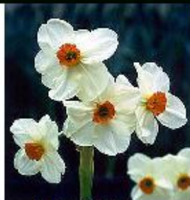
Narcissi Germanium (Tazetta) 12"-24" inches tall Showy southern heirloom perennial with white perianth and bright scarlet-orange cup. Full sun to part shade. 4 to 6 flowers per stem. Sweetly fragrant. Zones 5-9