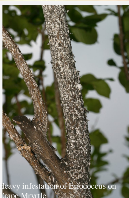
Heavy infestation of Eriococcus on Crape Myrtle

A relatively new insect pest is troubling crape myrtle in north Texas cities and backyards. Although an official name has yet to be given, this insect is thought to be an exotic pest that has somehow found its way to north Texas.