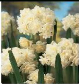
Narcissi Ericheer (Double) 12"-14" inches tall Double white blossoms with light yellow flecks. 15-20 florets per stem. Great naturalizer. Very fragrant. Zones 3-8