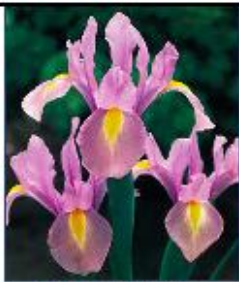
Dutch Iris Rosario 18"-22" tall Aster-violet standards with a pink flush and matching falls with bronze-yellow blotches Linear form Blooms late Spring Zones 5-8