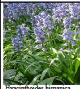
Hyacinthoides hispanica Excelsior Spanish Bluebells 12"-15" tall Very adaptable. Circa 1601. Produces 15-20 bell shaped flowers on long stems with strap-like foliage. This 1906 award winner is blue violet with darker marine-blue mid veins. Shade tolerant. Naturalizes. Zones 4-10