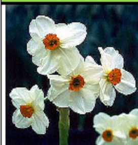
Narcissi Geranium (Tazetta) 12"-24" inches tall Showy southern heirloom perennial with white perianth and bright scarlet-orange cup. Full sun to part shade. 4 to 6 flowers per stem. Sweetly fragrant. Zones 5-9