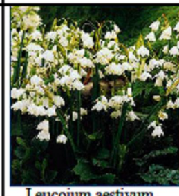
Leucojum aestivum Summer Snow Flake 12"-15" inches tall English native circa 1759 Bell shaped white flower with green tips. Strappy grass-like foliage. Hardy naturalizer. Zones 4-9