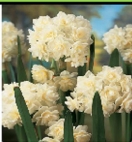
Narcissi Erlicheer (Double) 12"-14" inches tall Double white blossoms with light yellow flecks. 15-20 florets per stem. Great naturalizer. Very fragrant. Zones 3-8