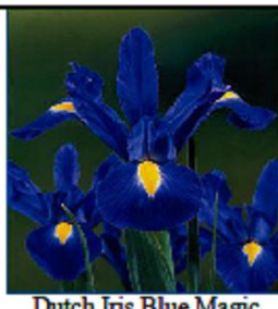
Dutch Iris Blue Magic 18"-22" inches tall Dutch Iris were hybridized in the early 1900's from a 16th century native Spanish variety. Deep heliotrope-blue with yellow blotches. Linear form Blooms late Spring Zones 5-8