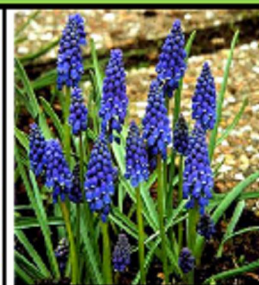
Muscari armeniacum Grape Hyacinth 4"-6" inches tall Circa 1878 Native to Turkey Naturalizes. This original Blue Grape Hyacinth is bright cobalt blue. Normally deer proof. Zones 5-8