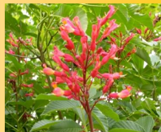
Aesculus pavia Red Buckeye

Where: Randol Mill Park Greenhouse 1901 W Randol Mill Rd. Arlington, TX (The greenhouse is in the rear of the park behind the swimming pool.)