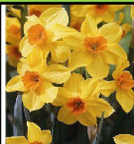
Narcissi Falconet (Tazetta) 12"-14" inches tall Bold beauty has yellow perianth with orange cup. 4-8 florets per stem. Fragrant. Ideal for Southern gardens. Zones 5-9