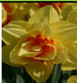
Narcissi Tahiti (Double) 14"-16" inches tall Very showy award winning with soft yellow perianth and double cup with orange center. 14"-16" Zones 3-8