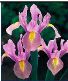
Dutch Iris Rosario 18"-22" tall Aster-violet standards with a pink flush and matching falls with bronze-yellow blotches Linear form Blooms late Spring Zones 5-8